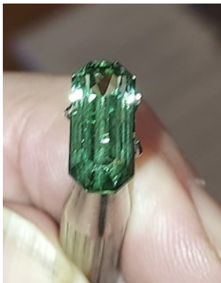
Blue-green faceted tourmaline

SILENT AUCTION OF SPECIMENS OF VALUE AND OTHER ITEMS